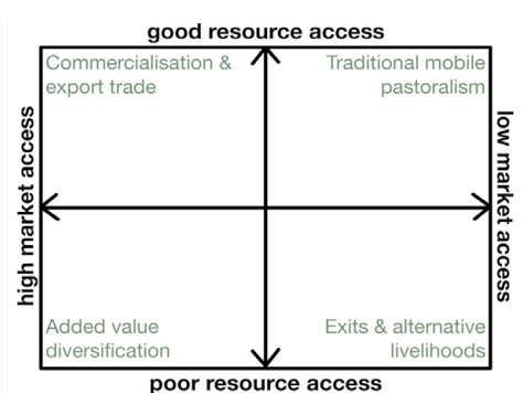
Figure 2: Four livelihood scenarios for future pastoralisms

'Traditional mobile pastoralism' is becoming rare, but is still an important scenariowhere market access is poor, options for commercialisation are limited and resources still relatively plentiful – in parts of the 'Karamoja cluster' of north-western Kenya, north-eastern Uganda and south-eastern South Sudan, and the Omo River Delta, Ethiopia. In virtually all other areas, increasing pressures are shaping pastoral livelihood options and opportunities. 'Land grabs' – local and external investment in land – are undermining access to critical pastoralist resources and increasing vulnerability. In Kenya, investors have targeted the Tana Delta, the largest wetland in the country and a vital drought-grazing land for pastoralists from across northern and eastern Kenya, xiv as well as Laikipia plateau for tourism. xv Private fencing of rangeland has resulted in disruption of traditional common propertybased range management - in Borana, Ethiopia and elsewhere. Even removal of small resource patches can undermine the functionality of the whole system, such as the grabbing of seasonal grazing lands in Gedaref state, Sudan.